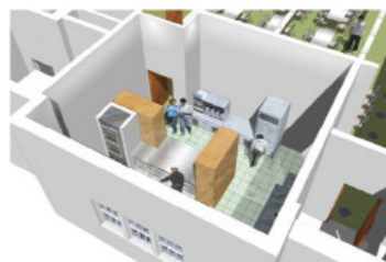
KITCHEN VIEW 1