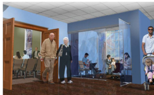
NARTHEX CITY ROOM