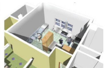
KITCHEN VIEW 2